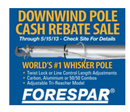
April Issue 2013